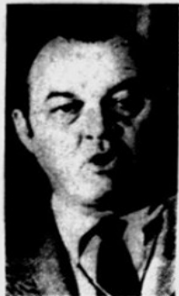
GOV. CLAUDE KIRK ... did he talk too much?