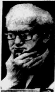
REP. MENDEL RIVERS ... did he get even?

WASHINGTON — His point made, the chairman of the House Armed Service Committee relented this week and permitted restoration of $10-million to the military construction authorization bill for the Naval Training Center at Orlando. The question is whether Gov. Claude Kirk got the point. Kirk nettled the committee chairman, Rep. L. Mendel Rivers, D-S.C., last February with a charge, on national television, that a helicopter plant was being located in South Carolina instead of Florida because of Rivers' influence.